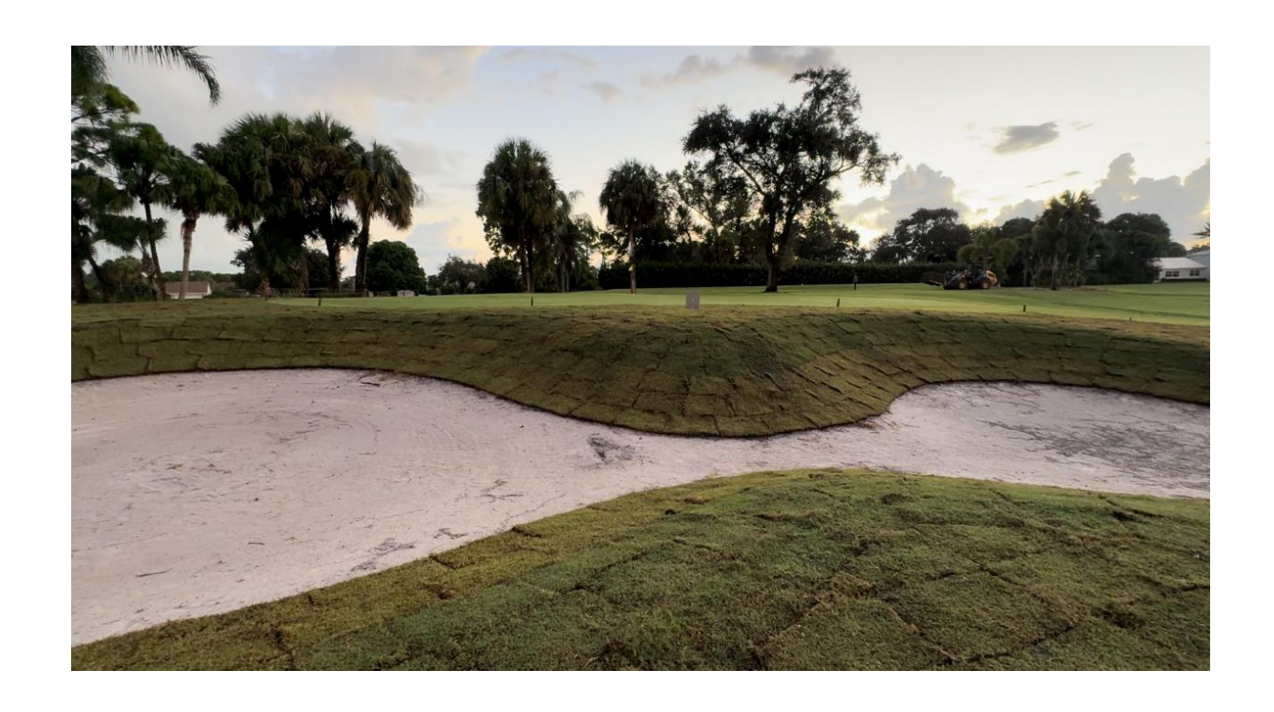
# 8 Projects completed adding 1,200 sqft to the Green, a new 1,500 sqft Bunker, and adding 8,000 sqft of Celebration Bermuda Grass to the surround and Lake Bank.