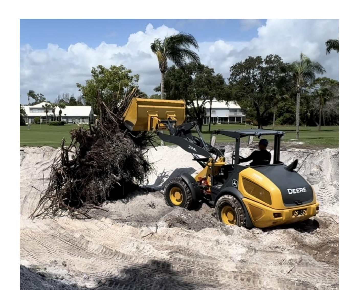
#10. The removal of tree stumps was challenging as you can see from the comparison in size to our loader.