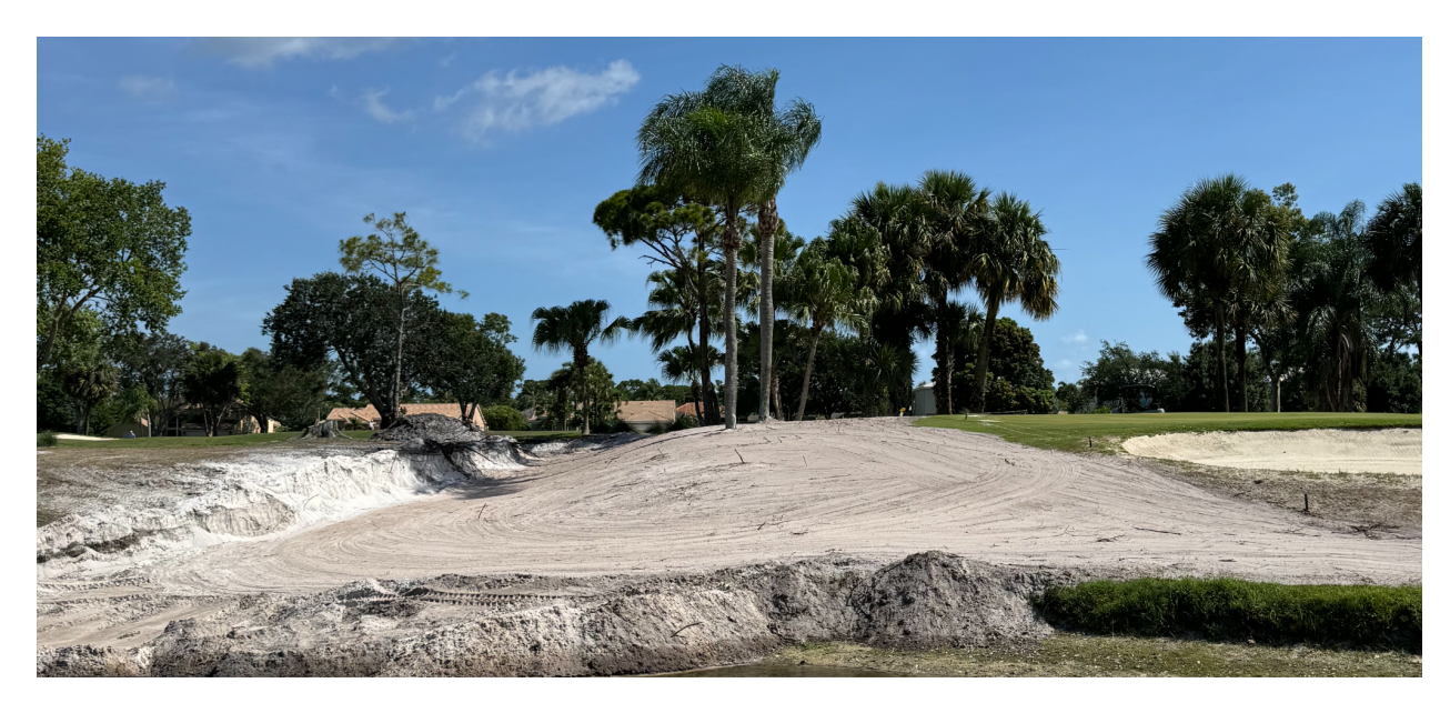
#8 Green surround, Bunker, Lake Bank, and Irrigation project began in June.