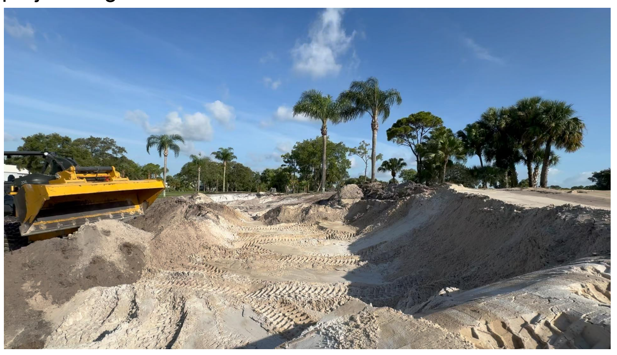
#8 Green and Bunker construction.