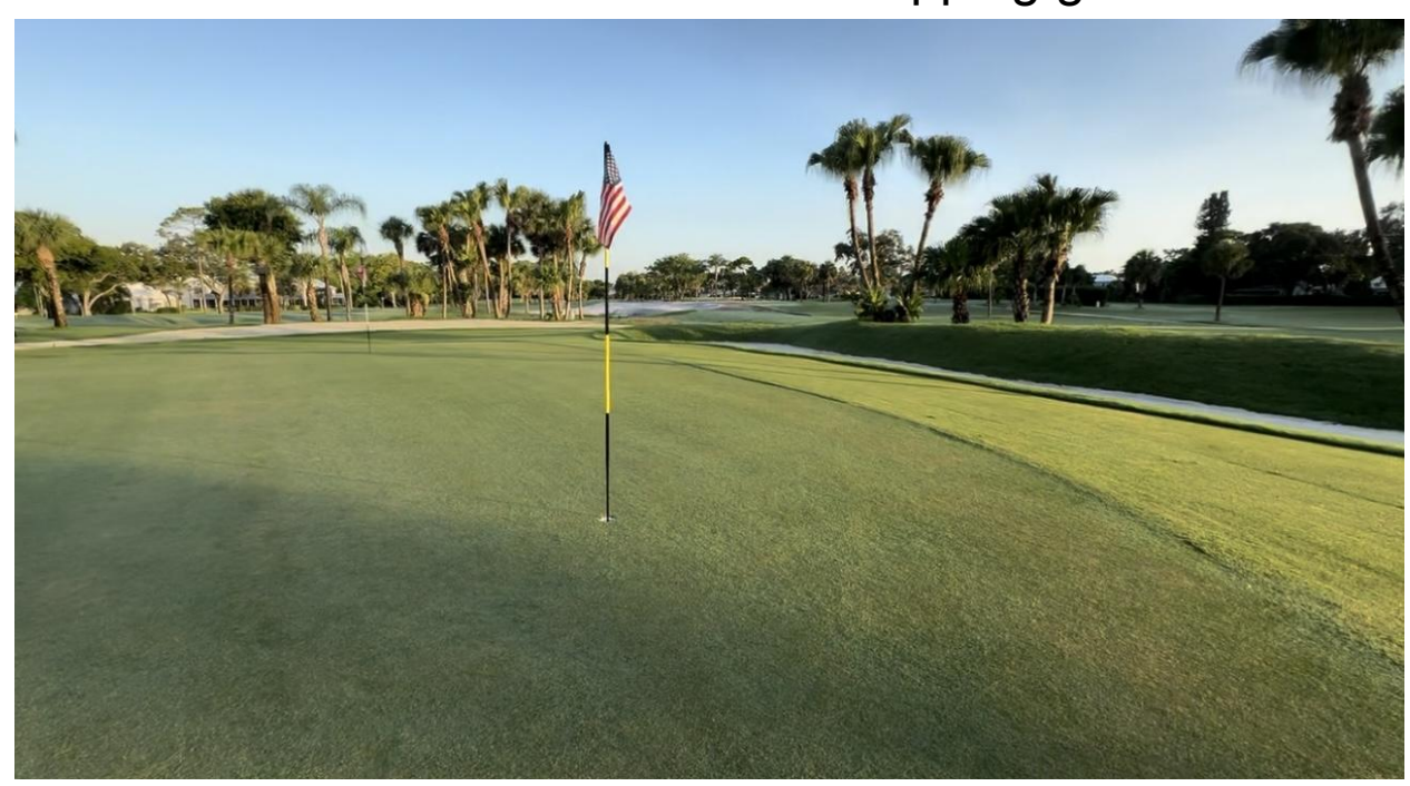
Chipping green and the surrounding practice facility has grown in beautifully. Turf heights are 1. Green 140 2. Collar/approach 475 3. Rough 1500