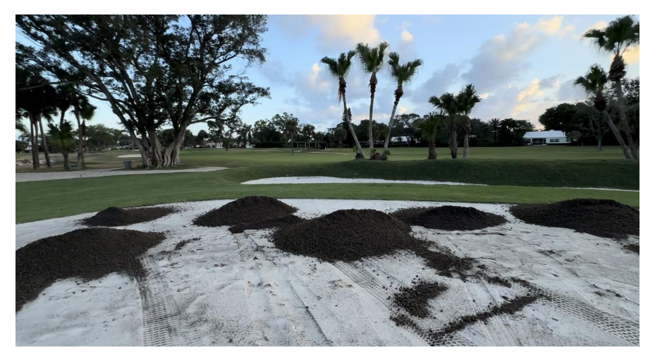
Plugs from our first greens aerification date were sown in for establishment of our turf for the chipping green.