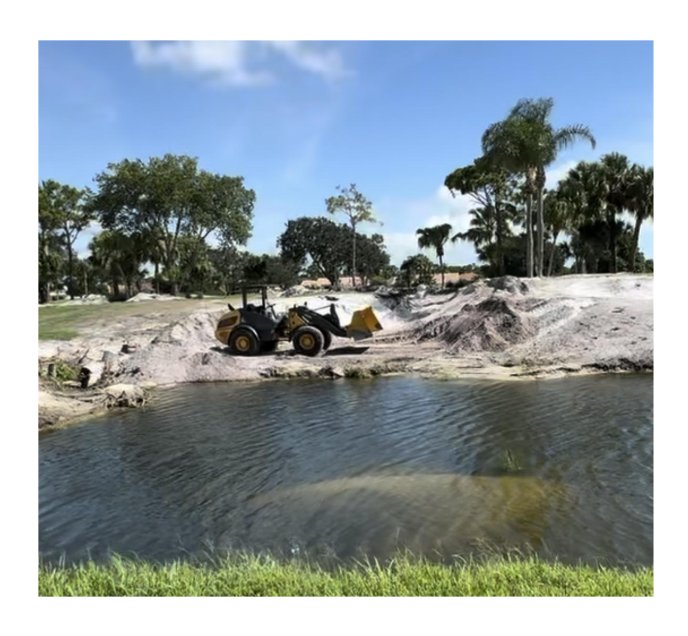
#10. Relocating soil from project area to Green Surround on #8.