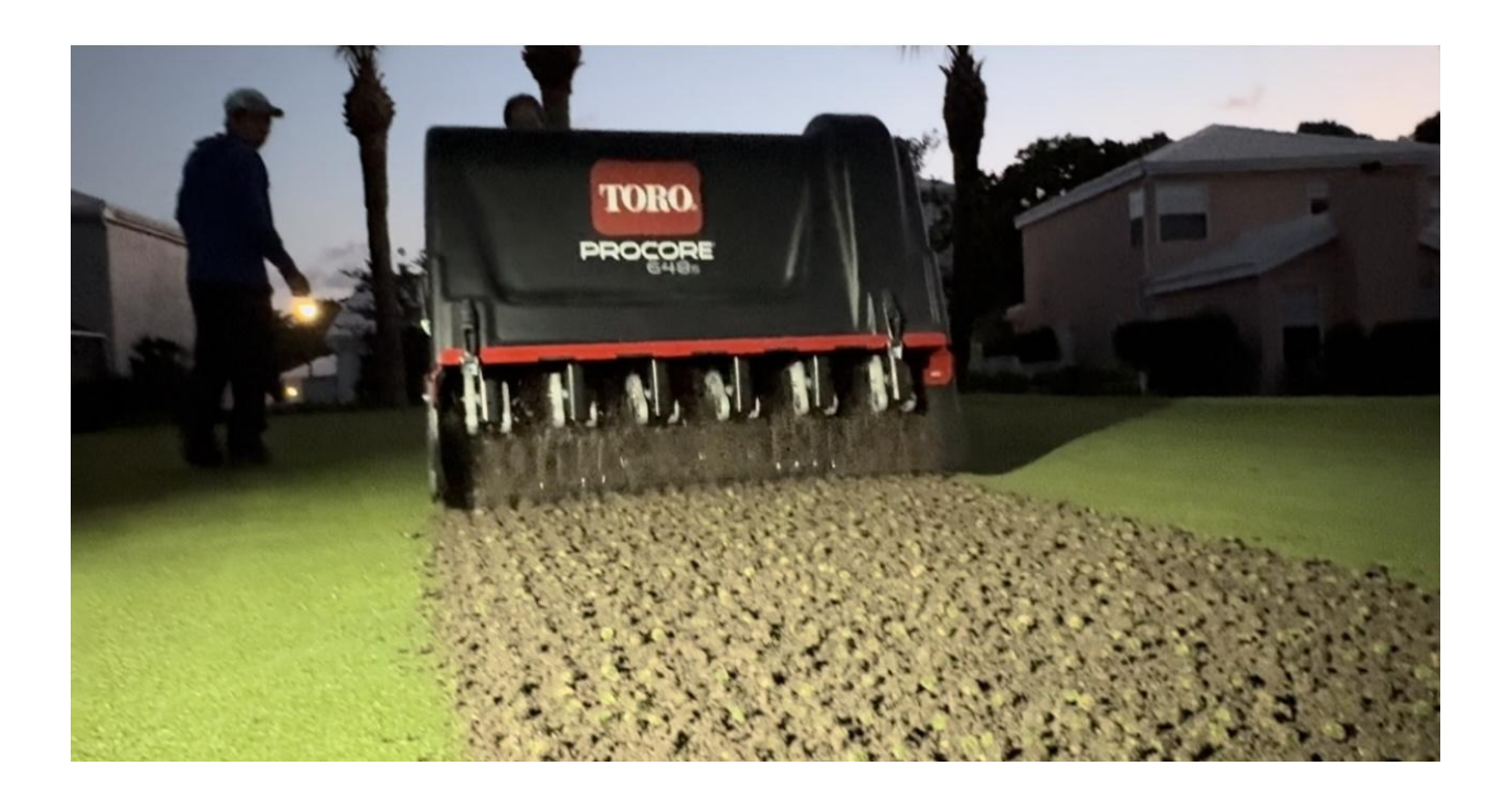
May 6/24 #5 Green Aerification 5/8 Core Tine 2x2 Spacing at 5" Depth

Another summer has come and gone with periods of dry and wet weather. Our hurricane season has spared us so far, but the surge of tropical weather throughout August and September have brought on muggy wet conditions. In preparation for transition from spring into summer we got an early start to our aerification program.